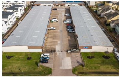
Sherwood Forest Business Park