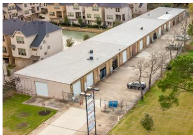
1411 Upland Business Park