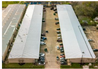
1771 Upland Business Park