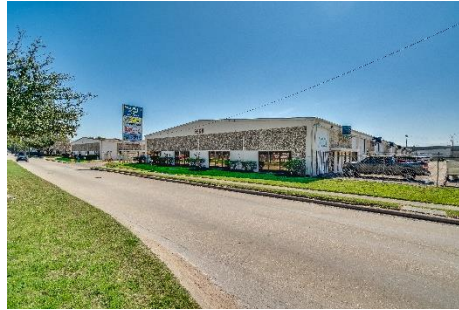
6999 Q1 West Little York Houston TX 77040